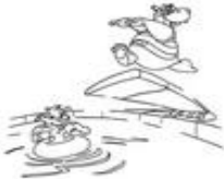
swimming where someone is diving