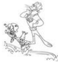
swimming with an adult

Answers: lifejacket, sunscreen, lifeguard, plastic water bottle, first-aid kit, sandals, safety ring, swimming with an adult